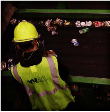
#Recycling101: Sorters work hard to keep nonrecyclables out. Picture via @WasteManagement http://www.rorr.com