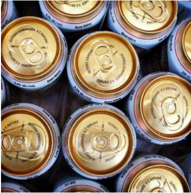
When it goes in your #recycling bin, a can may become a new can in 60 days. #Green #Fact www.RORR.com