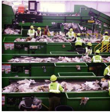
Let's sort this out. #Recycling101 http://rorr.com pic.twitter.com/qUbV1mQEDG