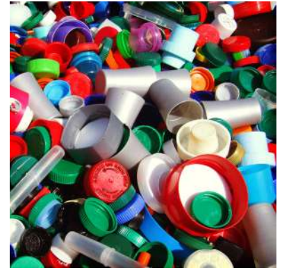
#Recycling101: Leave plastic tops on those bottles and jugs. Info via @WasteManagement http://www.rorr.com