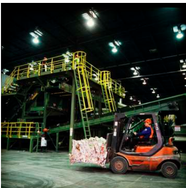
#Recycling101: Paper is baled and then taken to a dry area for storage. Via @WasteManagement http://rorr.com