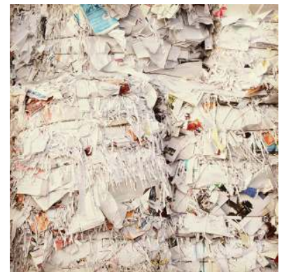
#Green #Fact: Recycled paper looks pretty cool when baled. #Recycling101 www.rorr.com