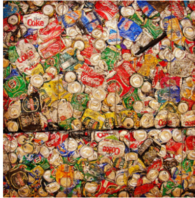
#Recycling101. There's no end to how many times aluminum can be recycled. Via @WasteManagement www.rorr.com