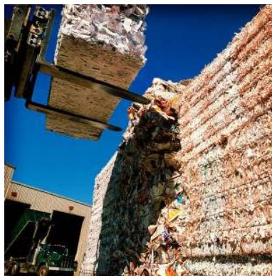
Paper bales can be stacked high. Keep it growing. Pic via @WasteManagement #Recycling101 http://rorr.com