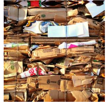
#Recycling101: Many boxes going to reuse. Hope no one needed to move over the weekend. http://www.rorr.com